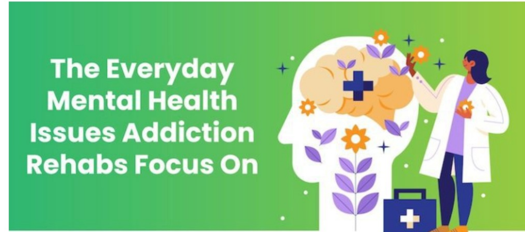
Part of the treatments conducted by alcohol rehabilitation centers focus on mental health or behavioral disorders, commonly known in treatment circles as a "dual diagnosis."